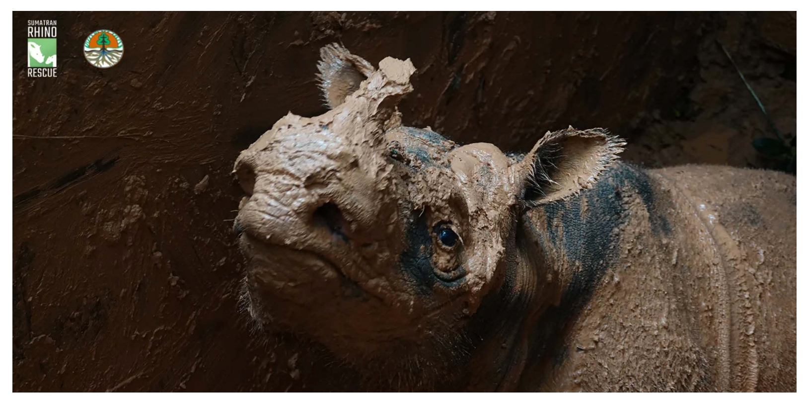
Look at her little nose!

Pahu is now the tenth Sumatran rhino in captivity. She's the first to be captured as part of this program, but other wild Sumatran rhinos have been captured previously. The hope is to rescue more Sumatran rhinos over the coming months to get them to mate. Breeding in captivity has been successful in the past for this species—once in 2012 and again in 2016. Taking them out of the wild to bone might raise concerns to some, but the animals face incredible risk from poaching and habitat loss in the dense forests of Indonesia.