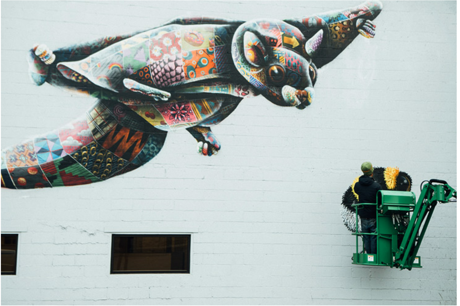
Louis Masai: The Art of Beeing USA Tour. Northern Flying Squirrel. Endangered. Nashville, TN. November 2016. (photo © Emil Walker)