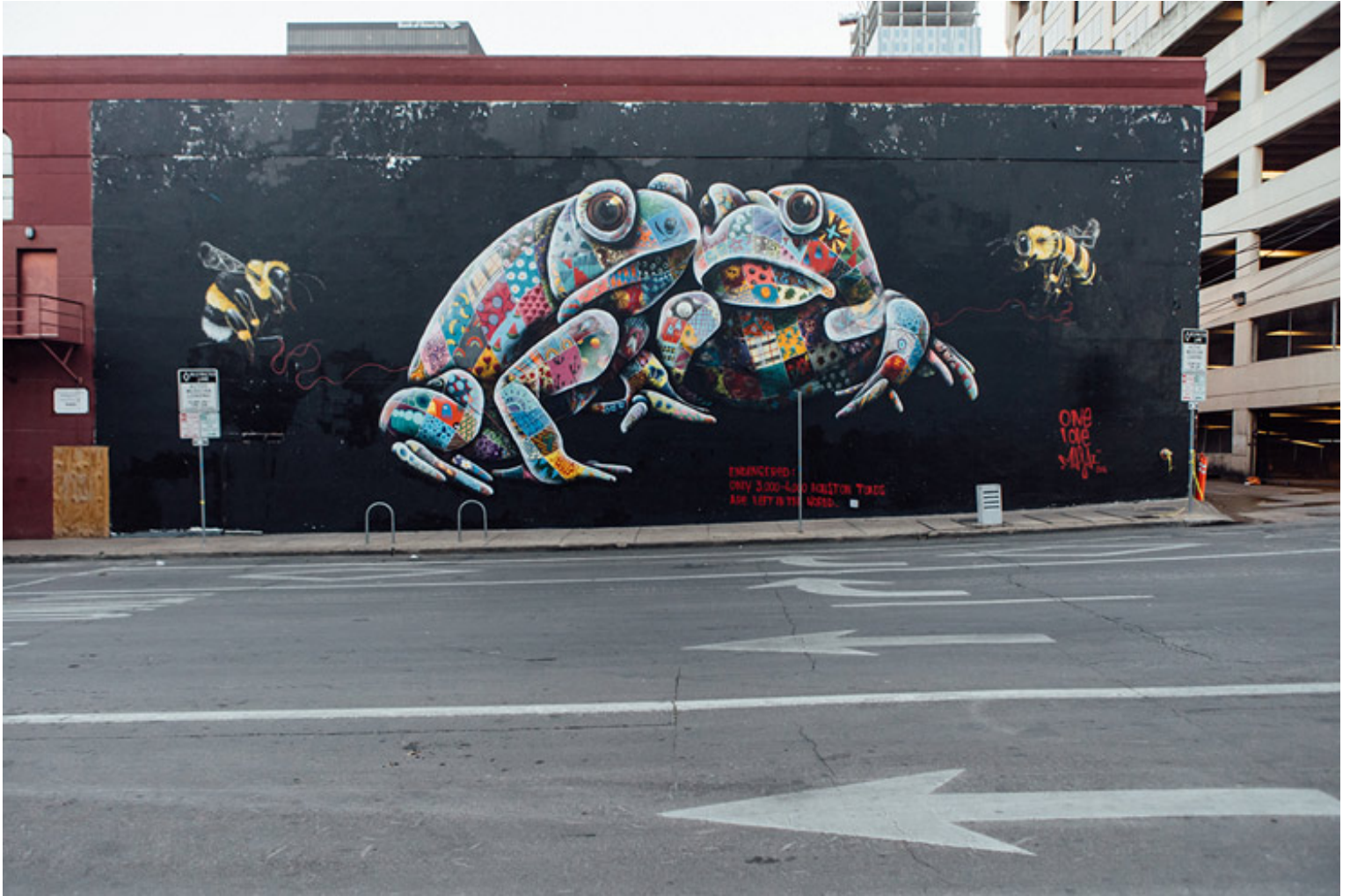
Louis Masai: The Art of Beeing USA Tour. Houston Toad. Endangered. Austin, TX. November 2016.