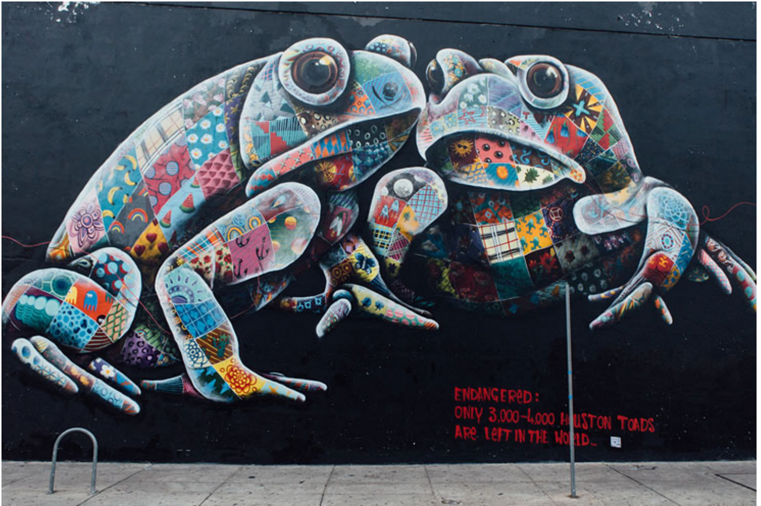
Louis Masai: The Art of Beeing USA Tour. Houston Toad. Endangered. Austin, TX. November 2016.