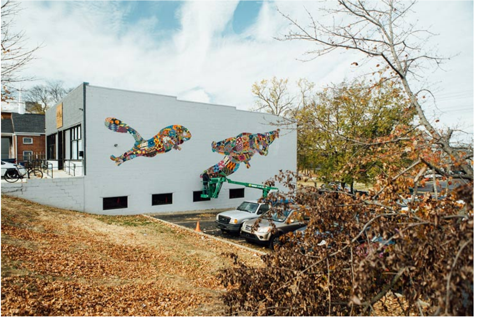
Louis Masai: The Art of Beeing USA Tour. Northern Flying Squirrel. Endangered. Nashville, TN. November 2016.

But you can help to save one of the rarest species – the Carolina Northern Flying Squirrel, which has been found in North Carolina, east Tennessee, and southwest Virginia. There doesn't appear to be a specific species trust but you can support the Tennessee Wildlife Federation to protect all local wildlife.