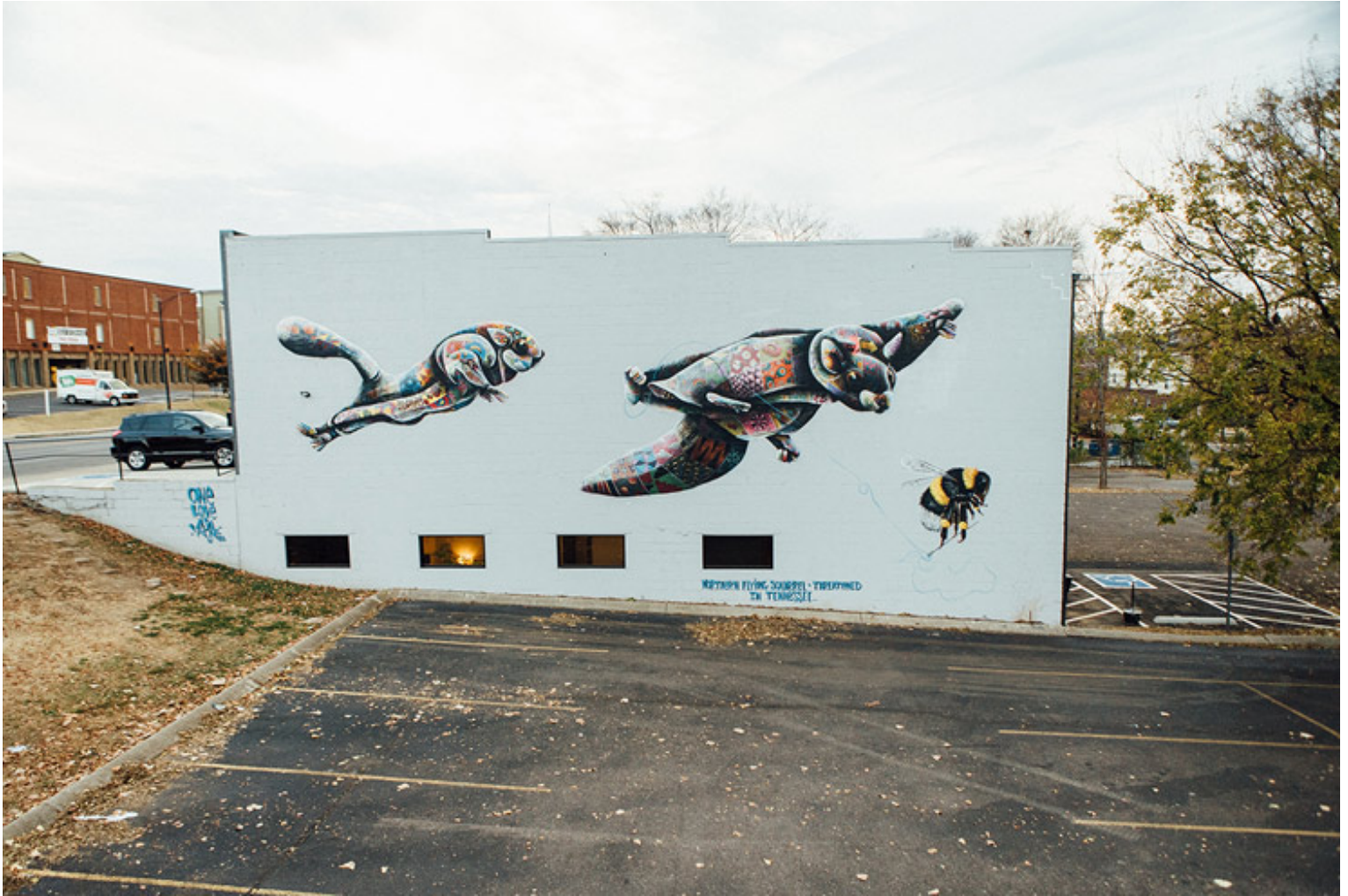
Louis Masai: The Art of Beeing USA Tour. Northern Flying Squirrel. Endangered. Nashville, TN. November 2016.

Click http://louismasai.com/projects/the-art-of-beeing/ to learn more about the project.