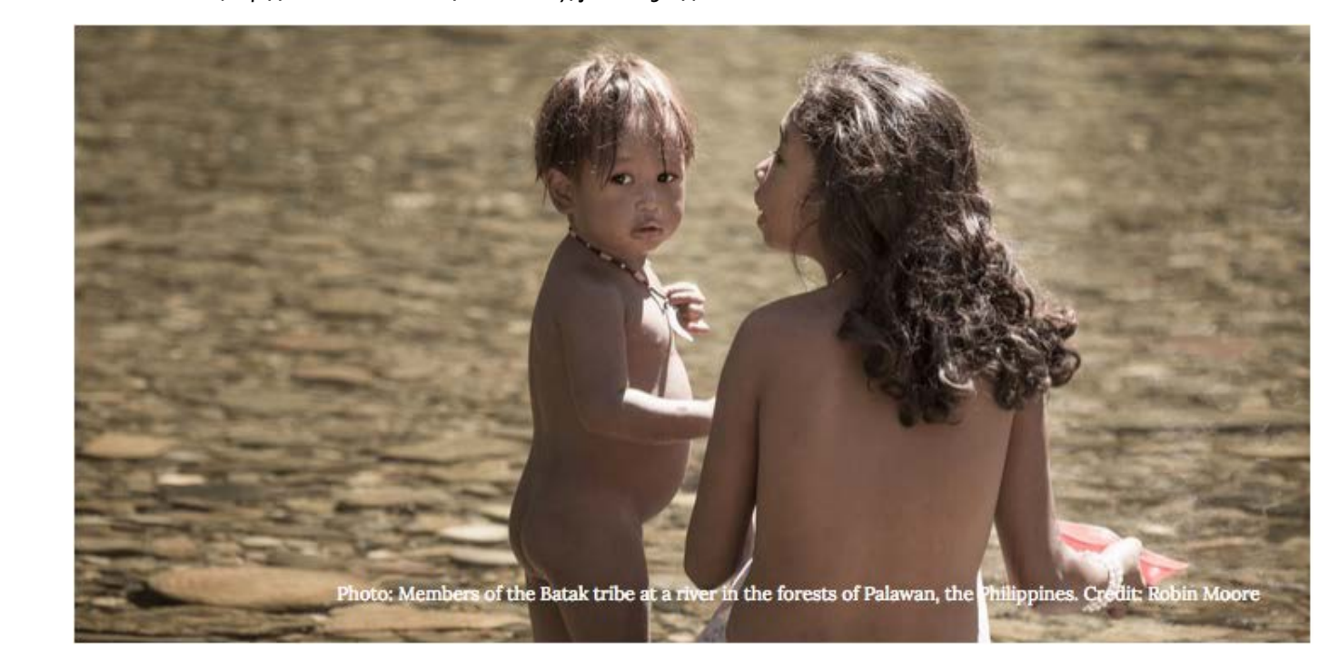
Photo: Members of the Batak tribe at a river in the forests of Palawan, the Philippines.